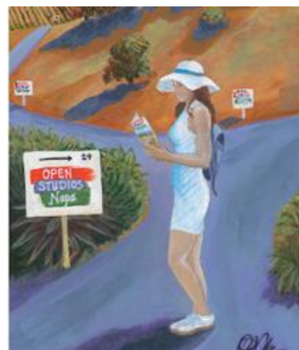
Open Studios brochure cover by Darlene Merle